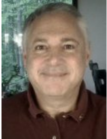
Mark Weisman Chair