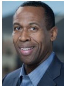
Gregory Davis Deputy Mayor