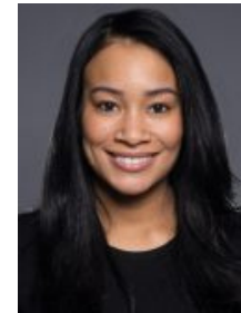
Danielle Wong Mayor